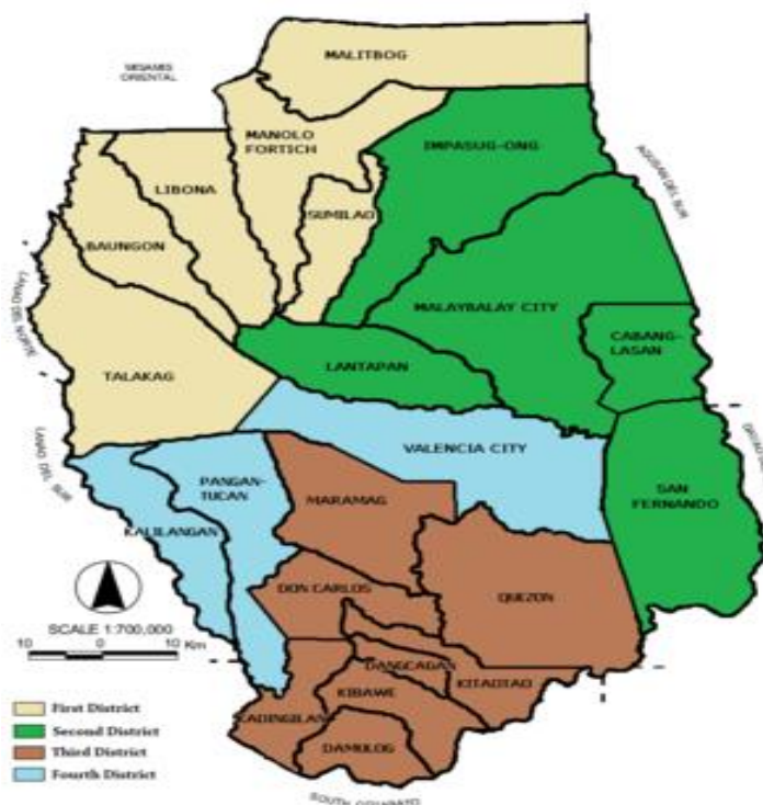
Map 1: Political Subdivision of Bukidnon